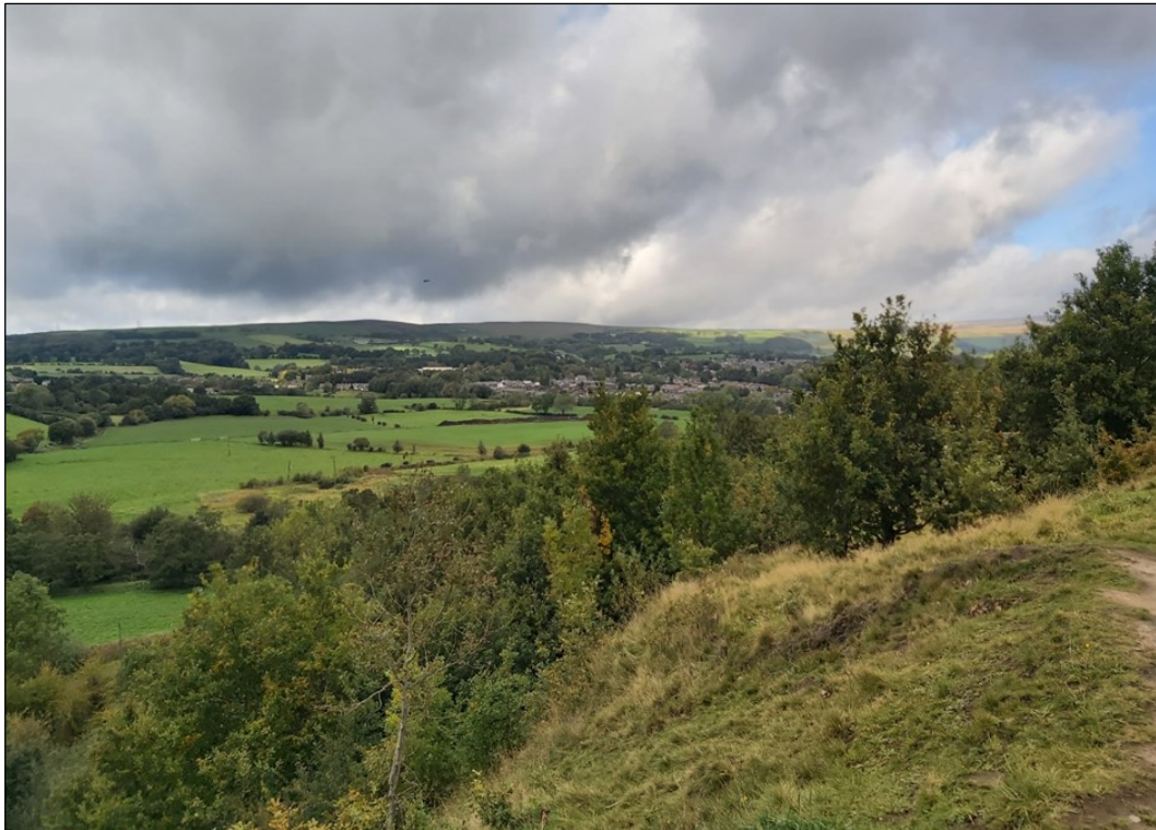
Insert 5-1 View north from Melandra Castle Roman fort across eastern extent of the Scheme (foreground) and to the landscape beyond