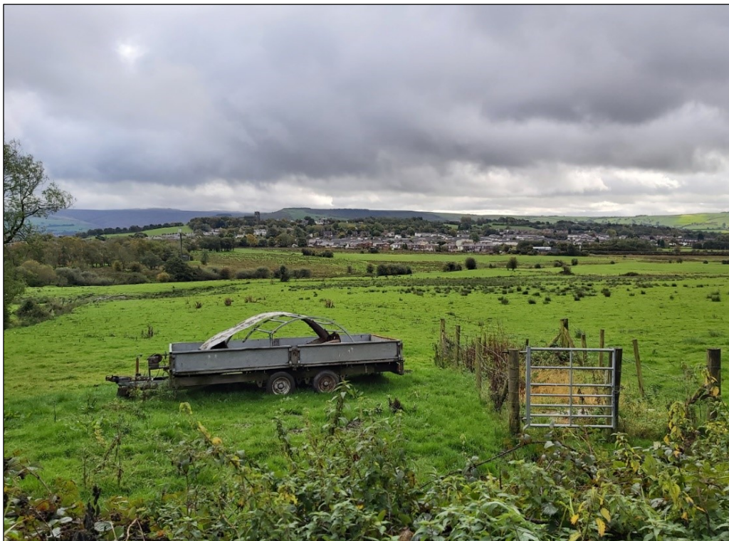
Insert 4-1 view facing south-east across the Scheme with Hurstclough Brook in the centre ground.