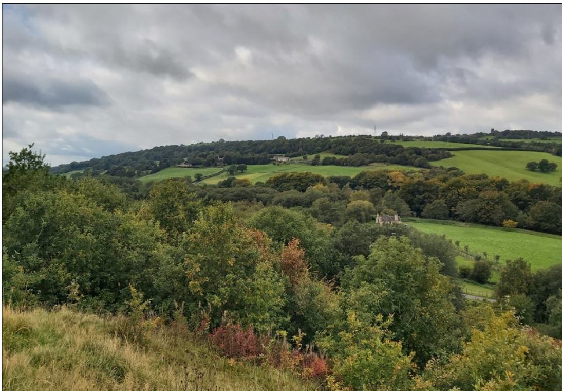
Insert 5-2 View west from Melandra Castle Roman fort towards Mottram-in-Longdendale (tower of Church of St Michael and All Angels - HA4) visible on hilltop, vegetation in foreground obscuring view of River Etherow in valley below