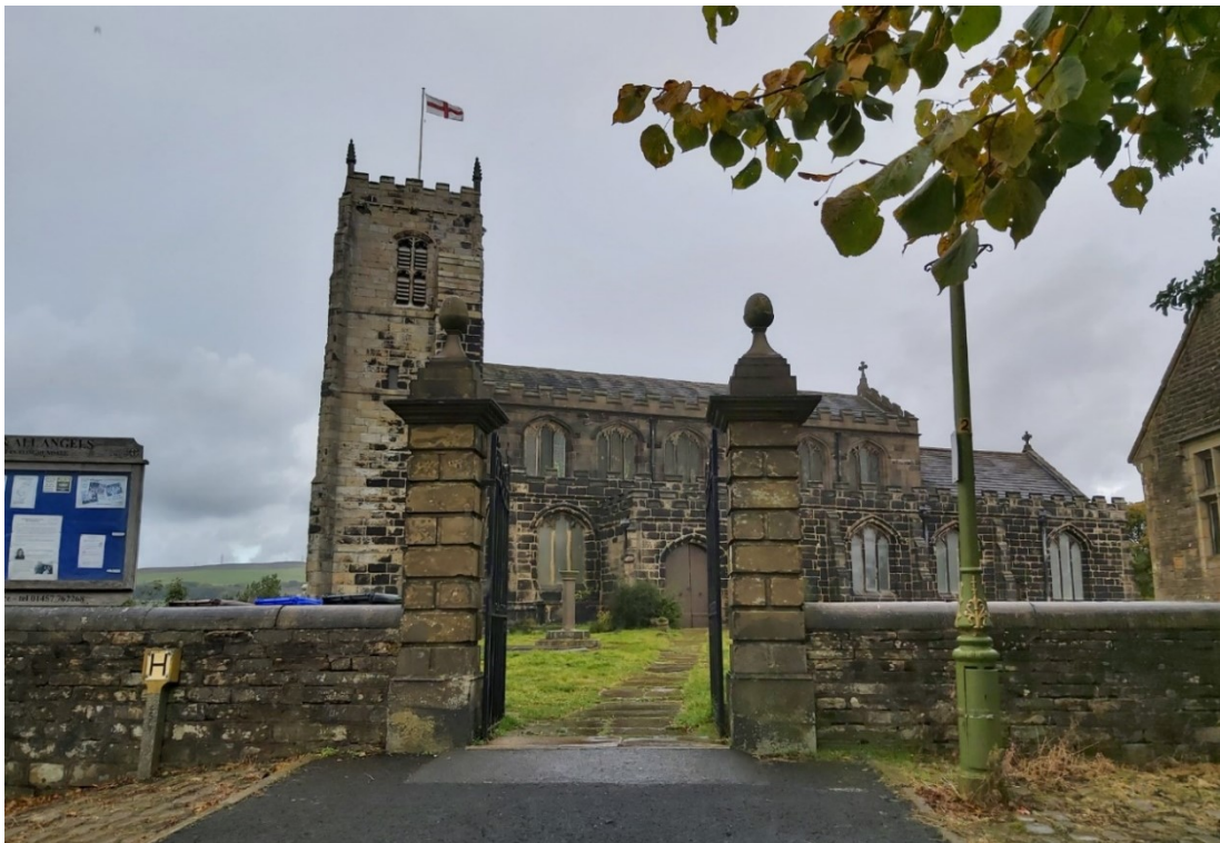
Insert 5-3 View north towards The Church of St Michael and All Angels (HA4), with Gatepiers and Walls to Graveyard (HA10) in foreground and partial view of the Old School (HA49) to righthand side of image