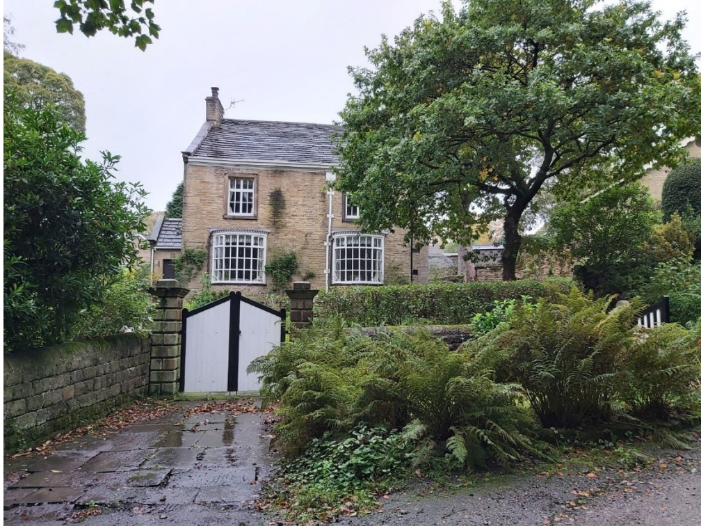
Insert 5-5 Dial House (HA6) seen from Old Hall Lane (looking northwest)