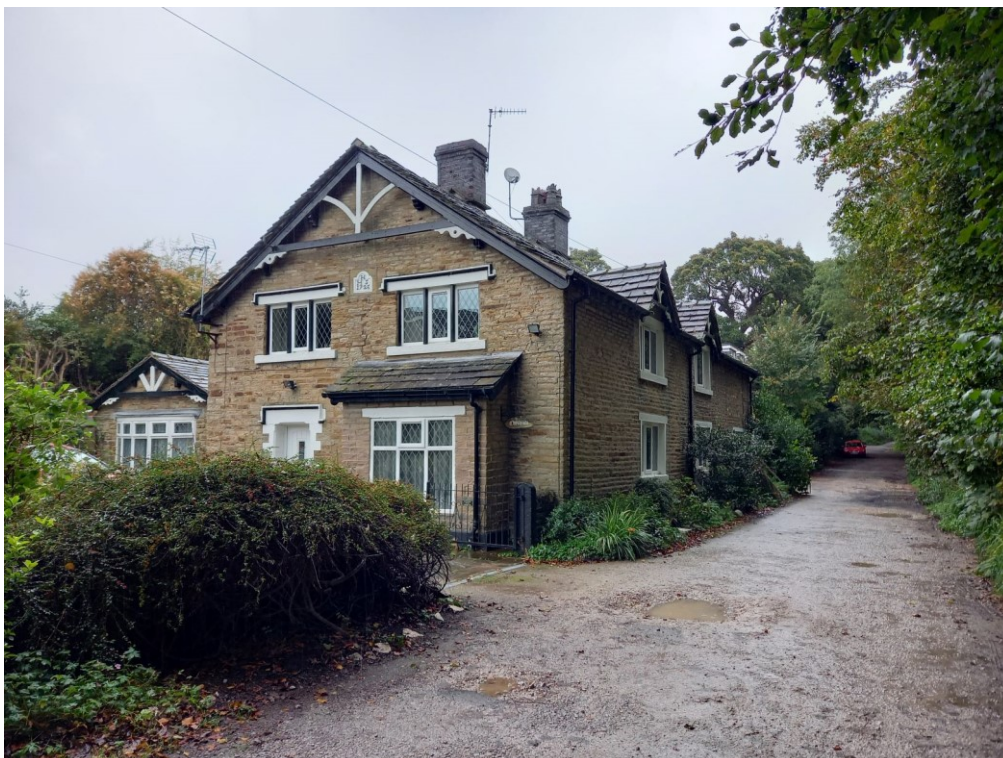
Insert 5-6 The Cottages north of Old Hall Lane (HA78) looking northeast