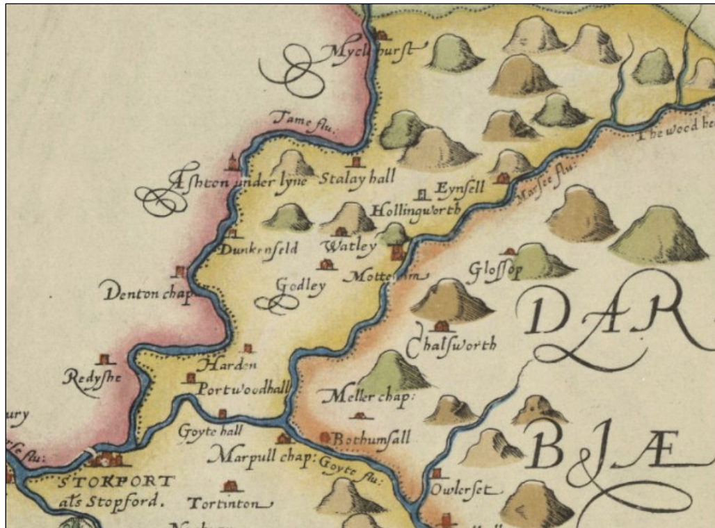
Insert 4-3 Christopher Saxton's 1577 Plan of Cheshire ( Cestriae Comitatus )

Post Medieval (1520 – c.1900) and Modern (Post 1901)