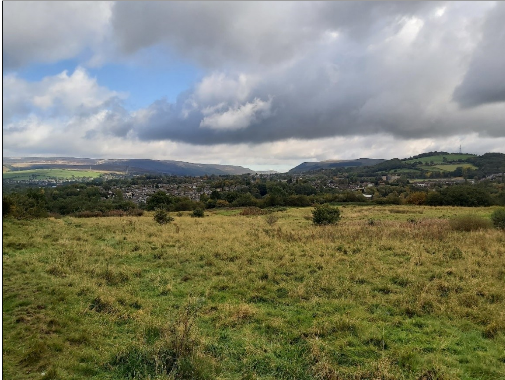
Insert 4-2 View north-east across Melandra Roman Fort (HA1), from north-west corner of surviving earthwork embankment