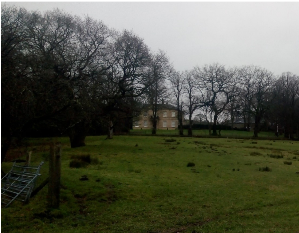
Insert 5-4 Mottram Old Hall (HA19) seen from the DCO boundary looking north