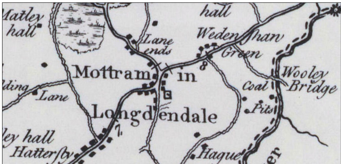
Insert 4-4 Burdett's 1777 Map of Cheshire

(reproduced with the permission of Cheshire Archives & Local Studies and the owner/depositor to whom copyright is reserved)