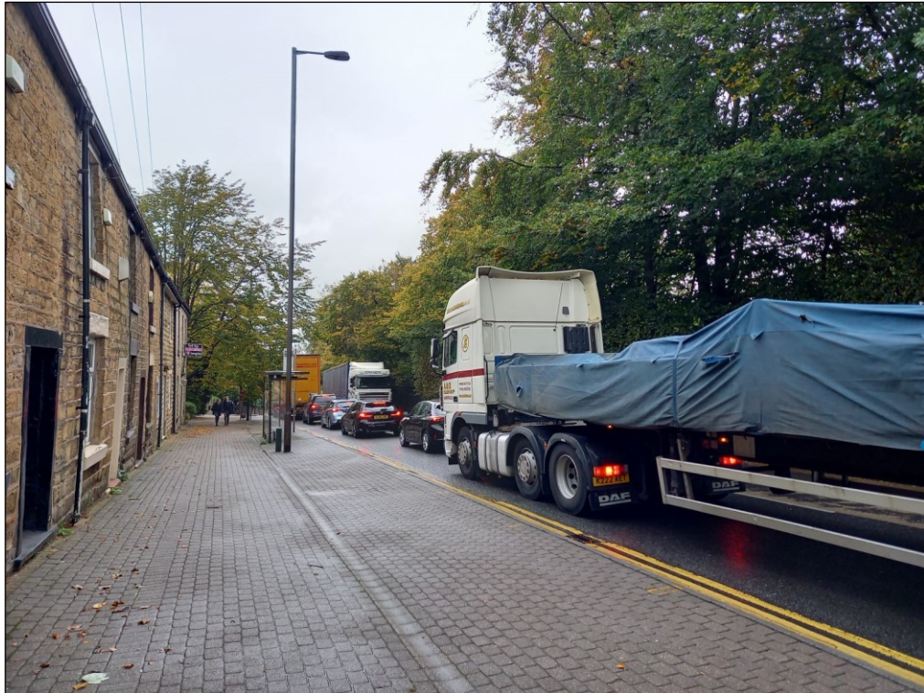
Insert 5-8 Stationary traffic on Mottram Moor within Mottram in Longdendale Conservation Area (HA2), looking southeast